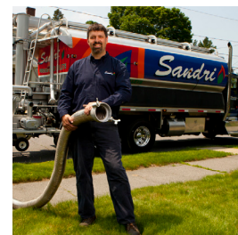
Biomass fuels can be conveniently delivered in bulk

The use of biomass fuels produced in America helps strengthen American energy independence and security.